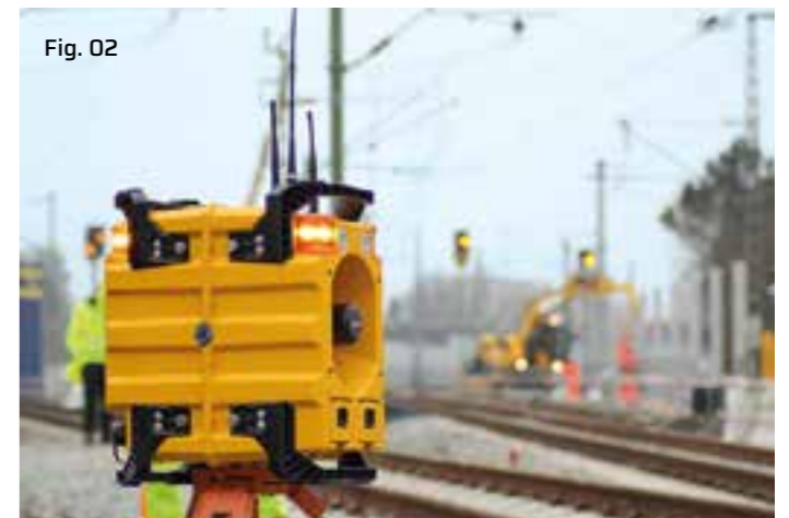
Fig. 01 Fixed data and transparent balises on an ETCS line section